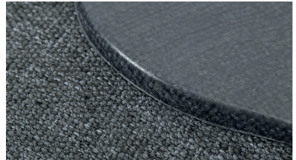
Fig. 4: Aesthetic part made of recycled carbon fibre

company's ecological footprint. Giving more added value to recycled carbon fibres through mechanical and aesthetic improvements and making the material usable in multiple applications can clearly reduce the consumption of raw materials such as virgin carbon, and therefore contribute to all the savings involved.