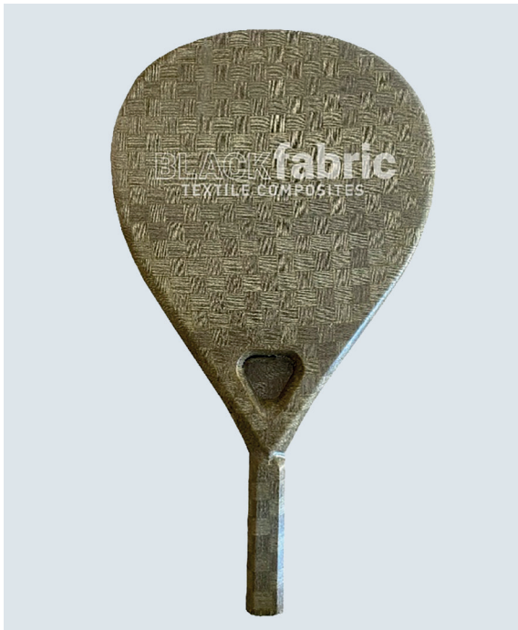
Fig. 2: Bidirectional tape weaving with natural fibres

This fabric is revolutionizing many sectors, and surely will be used in many applications in the next generations.