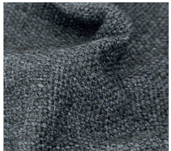
Fig. 3: Blackfabric's bidirectional fabric, made of 100% recycled fibres and a thermoplastic polymer

The resulting bidirectional fabric (Figure 3) looks similar to a conventional "wool fabric", is very flexible and mouldable and adapts well to any geometry. It is easy to cut, manipulate and mould. The fabric can be formed easily with conventional thermoforming or stamping processes, avoiding additional impregnation processes (infusion or injection), reducing processing times and notably reducing production costs.